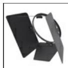
Adjustable dowsers - Vector 55 AP91500