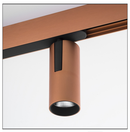
IP20 💮 🐺 Dimmerable: + 🕦 –