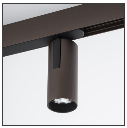
IP20 Dimmerable: + O-