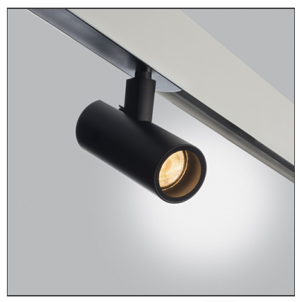
IP20 🕼 🐠 Dimmerable: +O-