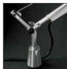
TOLOMEO SUPP.TAVOLO FISSO A004200