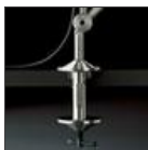
TOLOMEO MORSETTO A004100