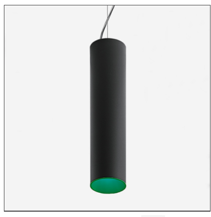
IP20 ⊕ ▼ Dimmerable: +①-