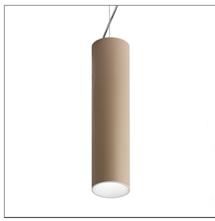
IP20 ⊕ ▼ Dimmerable: +①-