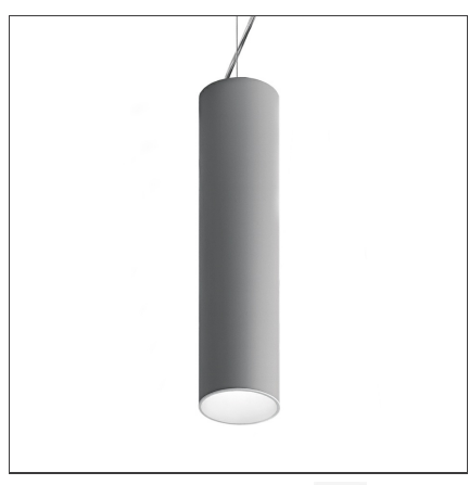
IP20 ⊕ ▼ Dimmerable: +①-