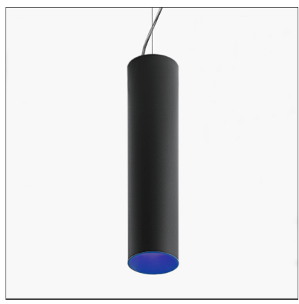
IP20 ⊕ ▼ Dimmerable: +①-