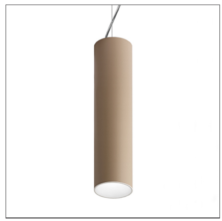
IP20 ⊕ ▼ Dimmerable: +①-