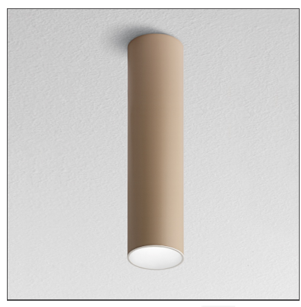
IP20 ⊕ ▼ Dimmerable: +①-