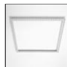
Recess frame for installation on plasterboard false ceiling. 625x625mm. M160602