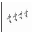
ALTOP FIXING BRACKETS (SET OF 4 PCS) M163520