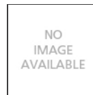
Sharpening wall grazer lens Kit (4pcs) - 26°x70° elliptical lenses kit. It has to be used on top of S 20° reflectors to get an elliptical beam (greater axis along the module length). It contains 4 lenses. AF06000