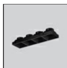
Screen 4x White AF95201