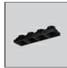
Screen 4x White AF95201

Driver CV 30W 24Vdc Selv - 220- 240 Vac - 153x41x32 (LxWxH) - up to 25W - Undimmable DV1032