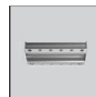
Recessed frame 16x AF90500