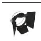
Accessory-holder (white) + Adjustable dowser (black) M082817