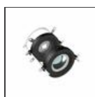
Accessory-holder (white) + projection lens and framing device M083917