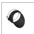
Accessory-holder (white) + wall washer screen (black) M083017