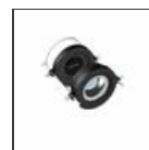
Accessory-holder (bianco) + Projection lens for gobo. Customized gobo to be ordered separately M083817