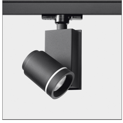
IP20 (≟) (₹$ C€