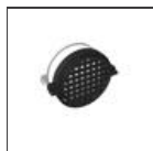
PICTO 125 - Accessory-holder + Louvre (black). black M083337