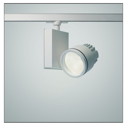
IP 20 ⊕ c €