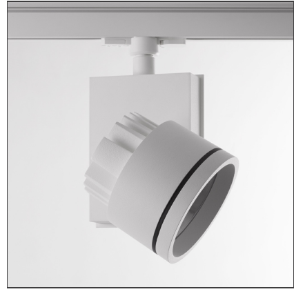
IP 20 ⊕ c €