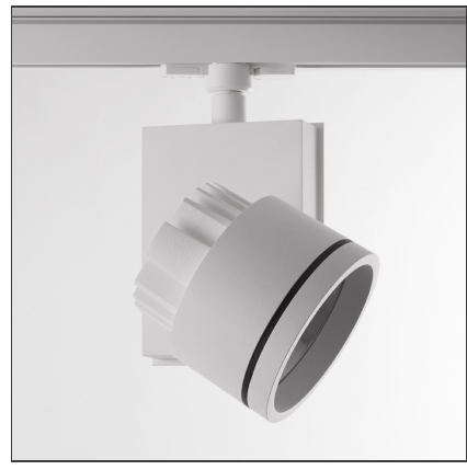
IP 20 ⊕ c €