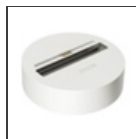
Accessory for ceiling installation (white) L176320