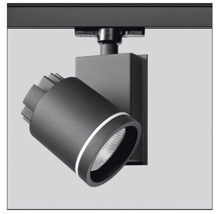
IP 20 ⊕ c €