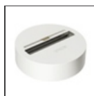
Accessory for ceiling installation (white) L176320