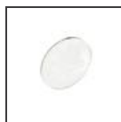
PICTO 100 - UV- Filter. M080545