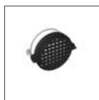
PICTO 100 - Accessory-holder + Louvre (black). White M081717