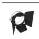
PICTO 100 - Accessory-holder (white) + Adjustable dowser (black). M082617