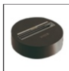
Accessory for ceiling installation (black) L176330