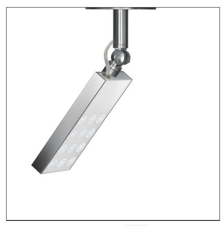
IP40 🖢 Dimmerable: + 🕦 -