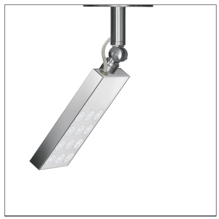
IP40 🖺 Dimmerable: + 🕦 -