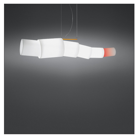
IP20 ⊕ 🕸 🔻 🕏 🖭 c€