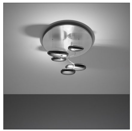
IP20 ⊕ ∰ ▼ C€ Dimmerable: + • •