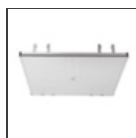
Prismatic screen in polycarbonate M239500