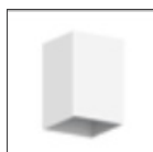
Accessory for ceiling installation M239920