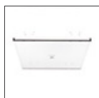
Transparent screen in polycarbonate M239300