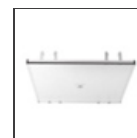
Opal screen in PMMA M239400