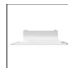
Support with rounded edge trim M240800