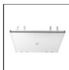
Opal screen in PMMA M239400