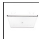
Transparent screen in polycarbonate M239300