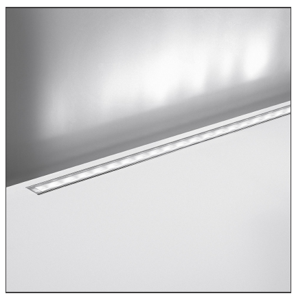
IP 65/67 ♠ ▼