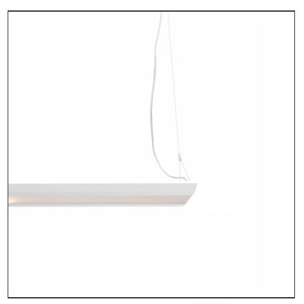
Dimmerable: + 10-