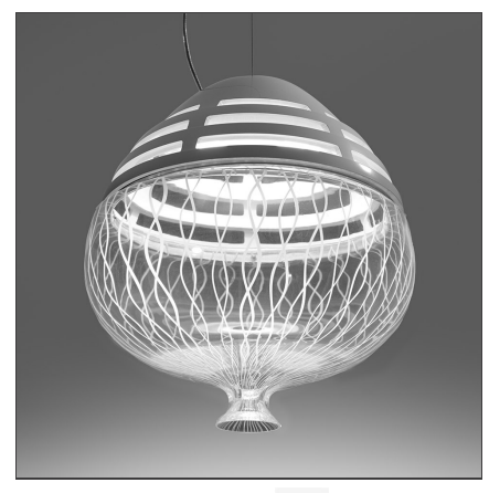
IP20 🚇 Dimmerable: + 🕦 -