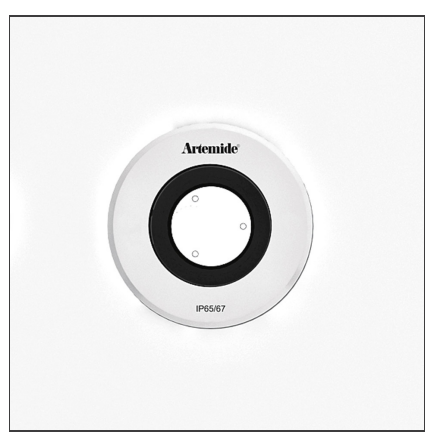
IP 65/67 🗥