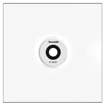
IP 65/67 ⟨⋒⟩ ▼