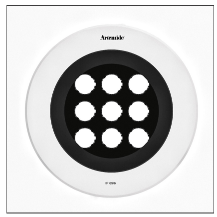
IP 65/67 🕼