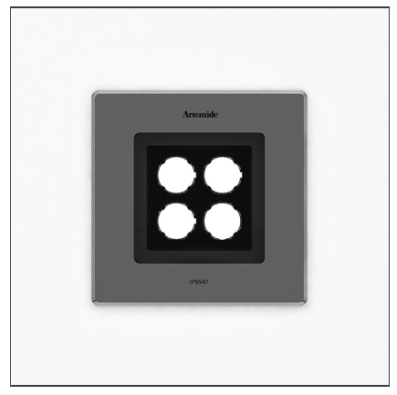
IP 65/67 (ii)