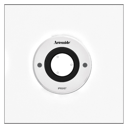
IP 65/67 🕼