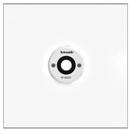
IP 65/67 ⟨⋒⟩ ▼