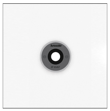
IP 65/67 ⟨⋒⟩ ▼