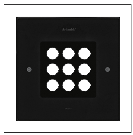
IP 65/67 🕼