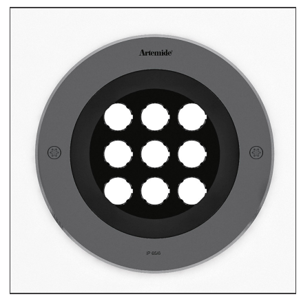
IP 65/67 (1)