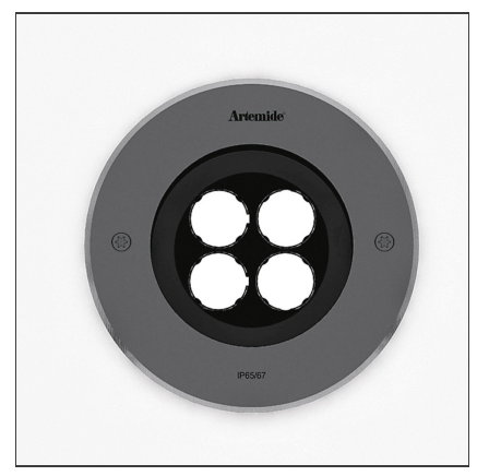
IP 65/67 🗥