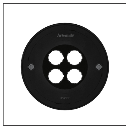
IP 65/67 🕼