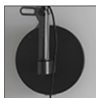
DEMETRA SUPPORTO W BCO 1742020A