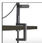
DEMETRA MORSETTO GRO 1744010A