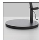
DEMETRA LED T BASE GRO 1733010A