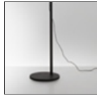
DEMETRA SUPPORTO F BCO 1741020A