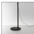
Demetra Supporto F NRO 1741040A